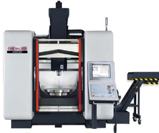
UNI5X-800 Gantry Type 5-Axis Machining Center.

Marketing Department Falcon Machine Tools Co., Ltd.